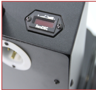
On Board Charging System with Indicator

The CartMover™ is a heavy-duty tool, but light enough to be easily maneuvered by anyone. Our innovative battery-powered design provides the mobility needed to increase worker productivity while enhancing safe work practices.