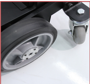
Durable Multi-Surface Wheels

The Light Duty CartMover™ can be equipped with a variety of pre-engineered or custom hitches to connect securely to various carts, bins, vehicles or other wheeled loads.