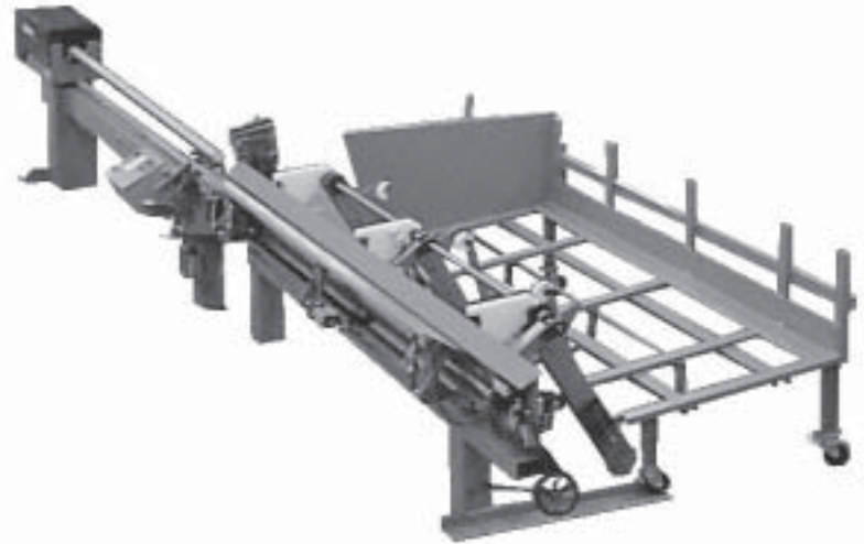
AutoLoader 3 attached to an Appleton A301 Core Cutter

The cut cores can be automatically separated from the trim and butt waste. The AutoLoader 3 can discharge the cut cores as they are cut, or accumulate them for a single transfer to an accumulator table or conveyer. Appleton Mfg. Division can provide cut core handling systems with both side and end discharge to load bins and shafts, for maximum system flexibility. Challenge us with your handling vision!