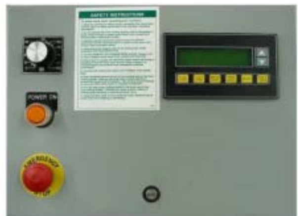
New panel can control both AutoLoader 3 and Cutter