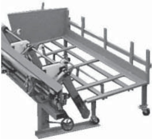
AutoLoader 3 and Wheeled Parent core Hopper

Parent cores are automatically fed from fixed or mobile core hoppers to the automated core cutter on demand. The operator is freed from the repetitive motion associated with loading parent cores. The system continues to supply cores until the operator input cut quantity is met.